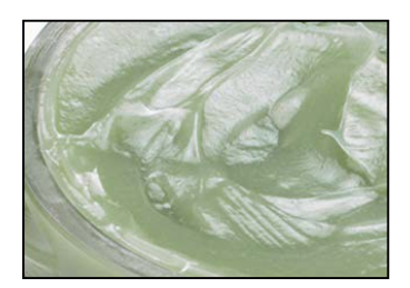
OMEGA 22 showing smooth texture and light green color

According to 4-Ball EP performance test (ASTM Test Method D-2596), the new OMEGA 22 achieves a weld load of 500 kgf, representing a remarkable 40% improvement in the grease's load carrying capacity!