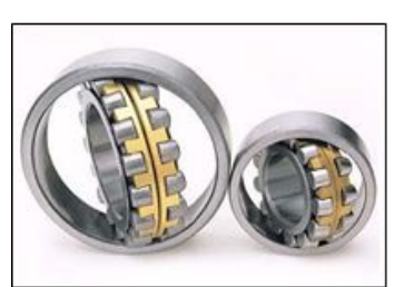
Spherical roller bearing